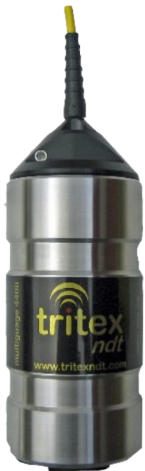
Multigaugage 4400 4000 m