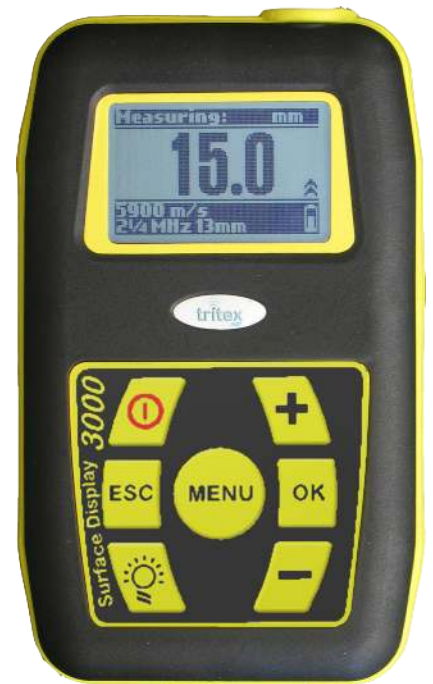
Surface Display Unit

The MultigaUGE 3000 Surface Software displays measurements onto a laptop which allows the topside person to log the data as required. The kit is supplied with an RS232 to USB converter for connection with most laptop computers.