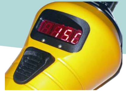
Large Bright 10 mm Display