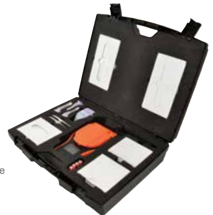
Supplied in a robust carry case