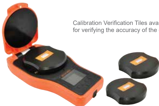
Calibration Verification Tiles available for verifying the accuracy of the gauge